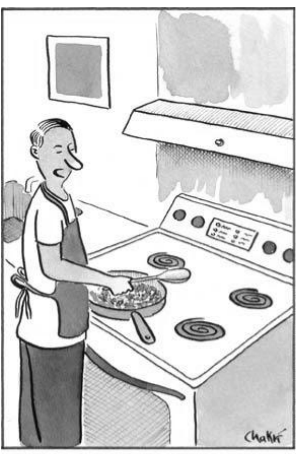
"Honey, we are out of chilli peppers. Can I borrow your pepper spray?"