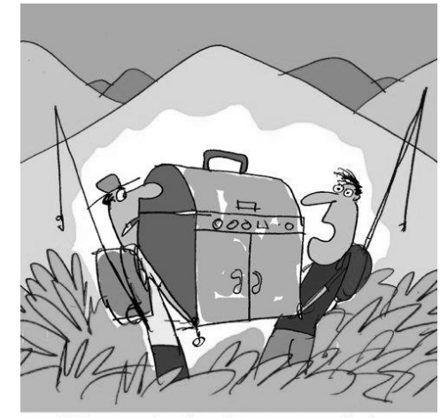
"Yes, we're hauling my grill the 20 miles to the lake. I'm not cooking fish on some cheap frying pan!"